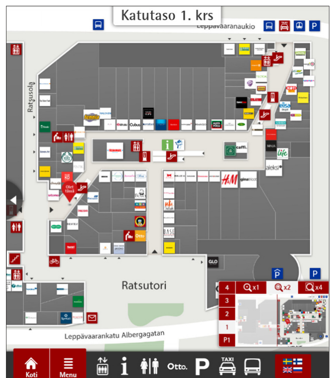
Site plan with information about the stores